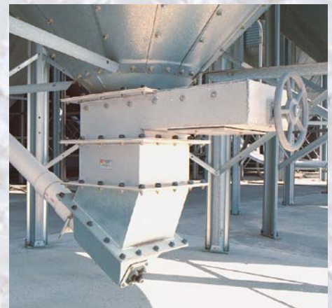
Boot Transitions come in straight-out as well as 15° and 30° versions for attaching FLEX-AUGER® Plus to silo, surge tank, granulator, or blender.