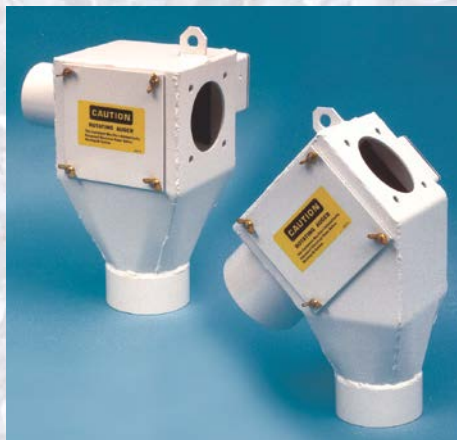
Auger Discharge Heads are available in both 90° and 45° configurations to offer maximum flexibility in system layout.